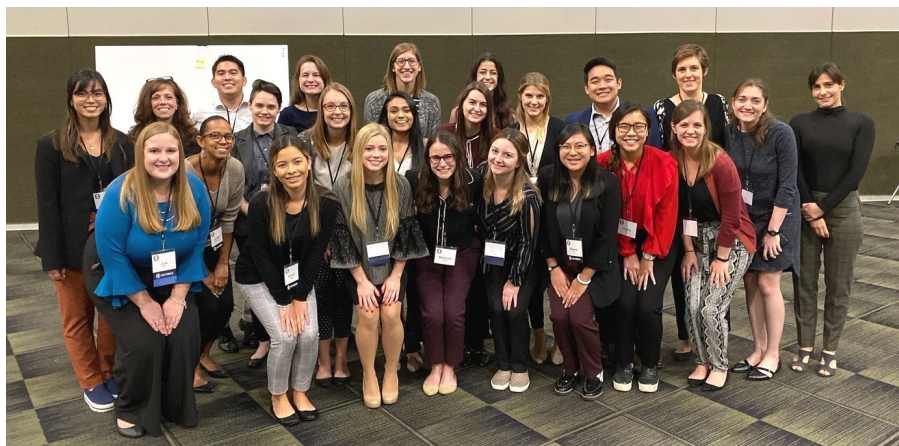
First- and second-year MS students at the ILOTA Conference

Approximately 50 first- and second-year MS students attended the 2019 Illinois Occupational Therapy Association Conference in Tinley Park, Illinois, October 4-5. UIC OT faculty, students and UI Health clinicians presented at the conference, including 20 second-year MS OT students who presented their evidence-based practice research projects. Thanks to alumni donors, 25 students received department travel awards to attend the ILOTA Conference.