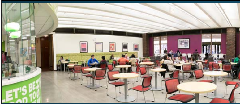
Cafeteria and seating area